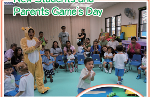
新生親子活動日 New Students and Parents Game's Day