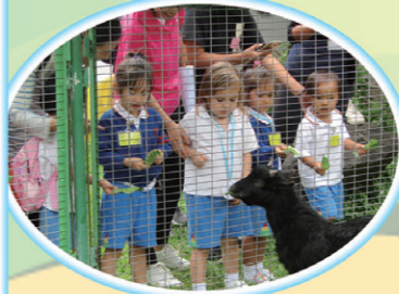
親子聖誕同歡派對 Parent-Child Christmas Party