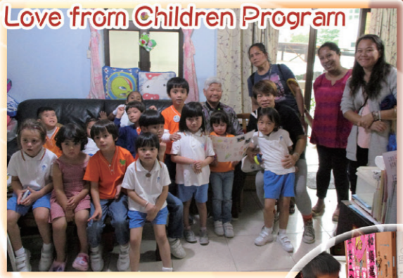
童心暖意 - 關愛長者活動 Love from Children Program