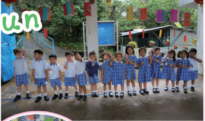
中秋賞燈會 Celebration of The Mid-Autumn Festival