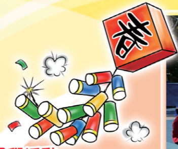
豬年新春團拜活動 Lunar New Year Party Activity