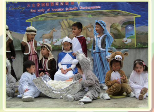
聯校第十八屆親子同樂日 Joint School 18th Parent-Child Fun Day